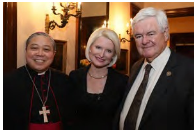
The Most Reverend Bernardito Auza, Her Excellency Callista Gingrich, and The Honorable Newt Gingrich

The Patrons Endowment, a board-restricted fund, ensures a sustainable future for Bethlehem University and the Bethlehem University Foundation. A gift to the Patrons Endowment is a "forever gift" that allows the Foundation to grow the endowment to better fulfill its mission of supporting Bethlehem University. This endowment is managed by the Board of Directors of the Bethlehem University Foundation and is invested in the United States with T. Rowe Price.